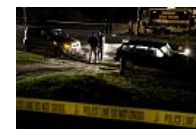
Fatal road rage shooting in St. Albans