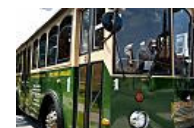
The trolley returns to Burlington