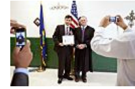
The Week in Pictures for Oct. 7th