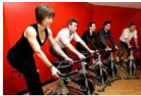
The #1 Exercise that Accelerates AGING (...) Old School New Body