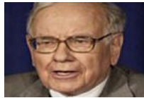
Warren Buffett Slams Obamacare Mandate Money Morning