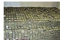
Make $1000's Per Day with Penny Stocks? Invests.com