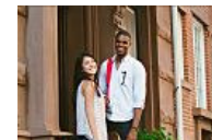
Urban Compass: a new take on NYC a... VentureBeat