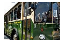
The trolley returns to Burlington