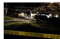
Fatal road rage shooting in St. Albans