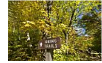
Fall hiking on Mt. Mansfield